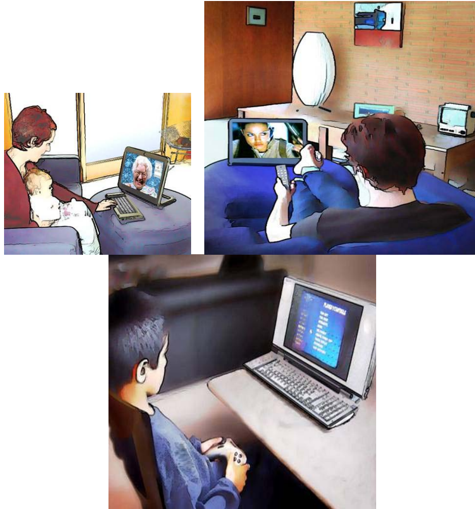
Figure 2(c): Mobile Entertainment