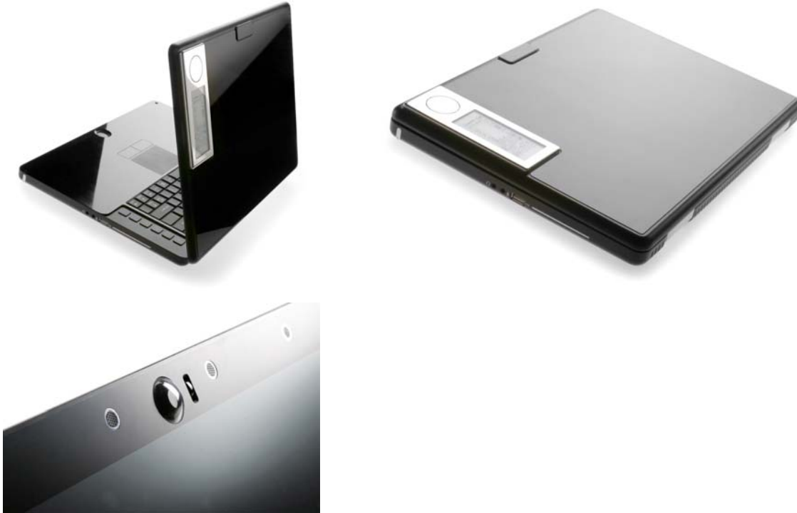
Figure 3: The Florence 15''