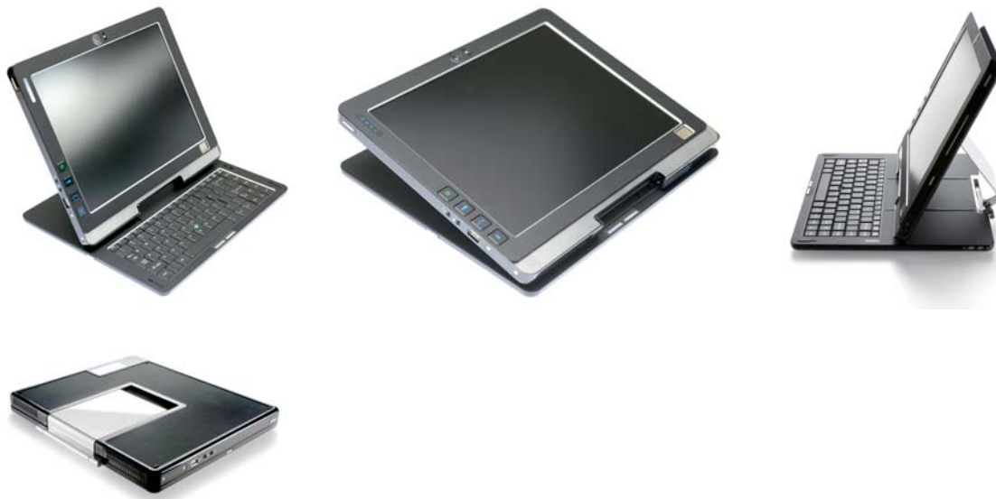
Figure 4: The Florence 12''