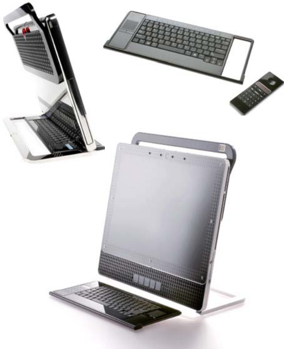
Figure 5: The Florence 17''