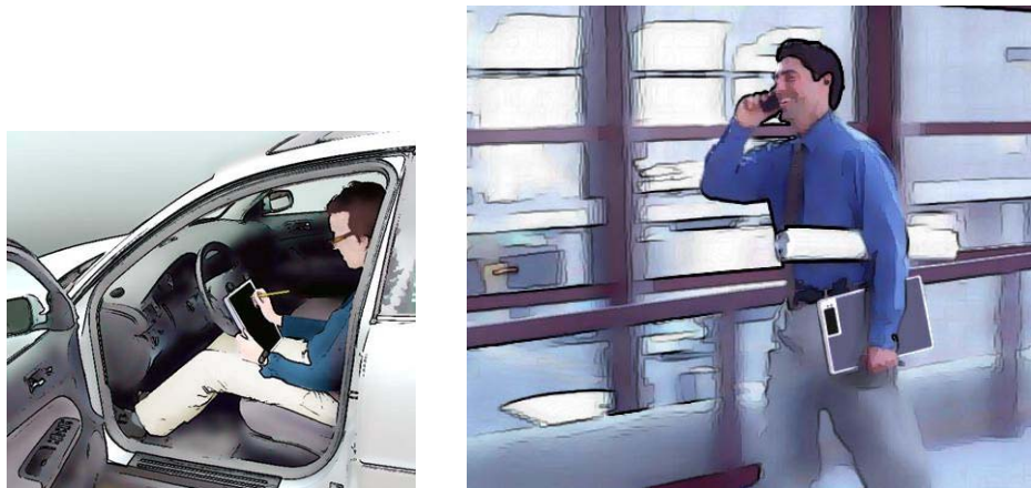
Figure 2(b): Mobile On-the-Go