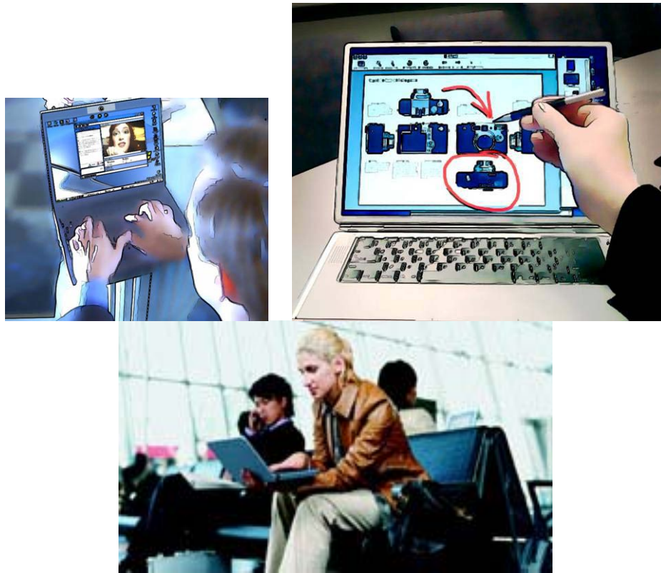
Figure 2(a): Mobile Digital Office