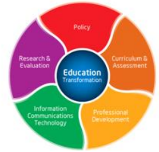
Intel's Education Transformation Model

While process is important, substance is essential. To be transformational, education policies must address the entire system: Curriculum and assessment, professional development, ICT, and research and evaluation. This section identifies and discusses the key policy issues that confront education leaders as they engage in the policy making process.