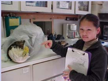
This eagle was killed by a power pole. What other ways do birds get injured?