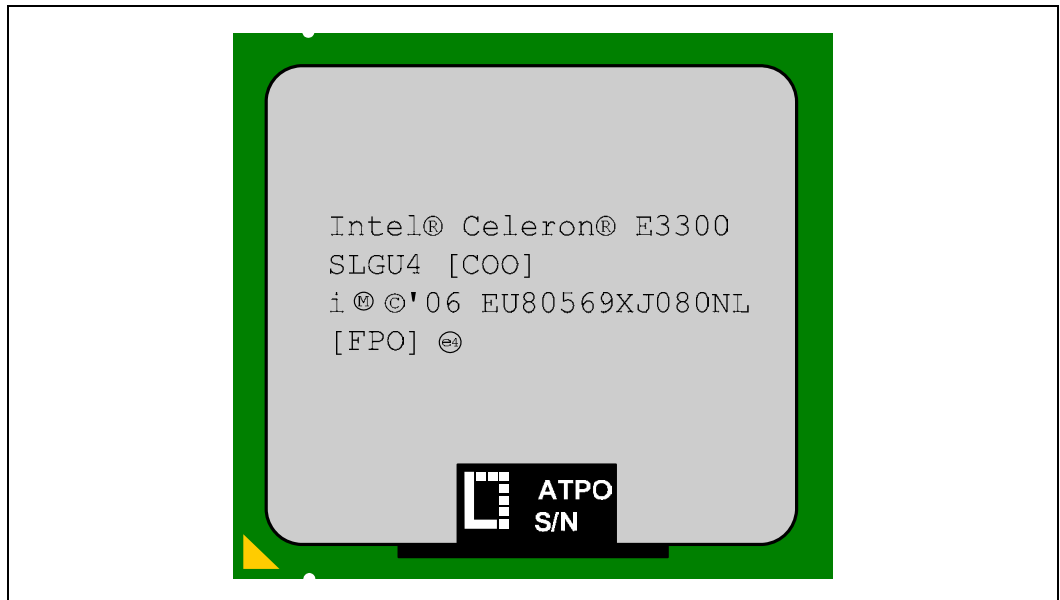
Figure 1. Processor Package Example