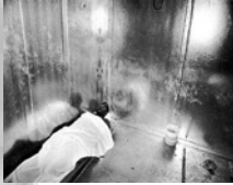
'Cold Blooded Murder!'